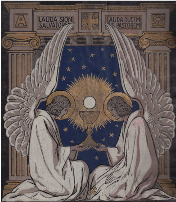
The Mystery in Theory

The manner in which the change occurs, the Catholic Church teaches, is a mystery : "The signs of bread and wine become, in a way surpassing understanding, the Body and Blood of Christ."