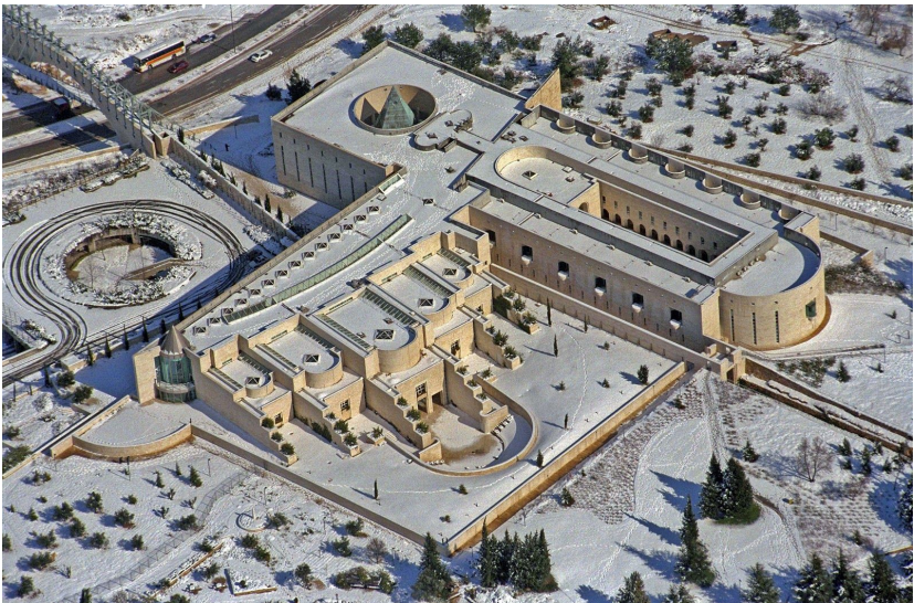
The Bow of Judah - The birth date of the Eucharistic Mysterium 25.5.67 is built into the structure

And made you like a sword of a mighty man