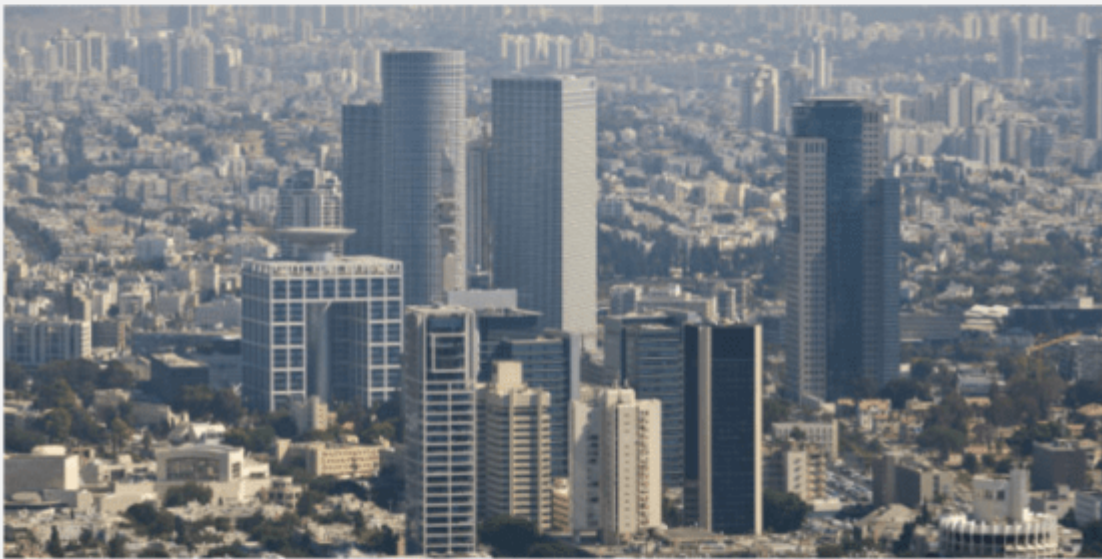
Aerial view of the Azrieli towers in Tel Aviv and the 'Kiryat' containing the Tel-Aviv District government center and the major Israel Defense Forces base, Camp Rabin.

He who dwells in the shelter of the Most High will abide in the shadow of the Almighty. I will say to the Lord, “My refuge and my fortress, my God, in whom I trust.” For he will deliver you from the snare of the fowler and from the deadly pestilence. He will cover you with his pinions, and under his wings you will find refuge; his faithfulness is a shield and buckler. You will not fear the terror of the night, nor the arrow that flies by day. Psalms 91:1-16 ( The Israel Bible™ )