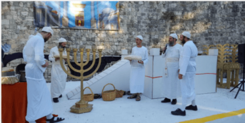
Special showbreads are brought as offerings by the Kohanim (priests).

The people that walked in darkness have seen a brilliant light; On those who dwelt in a land of gloom Light has dawned. Isaiah 9:1 (The Israel Bible™)