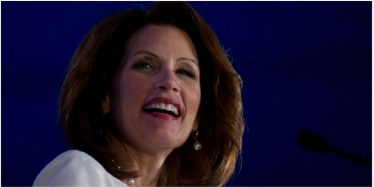
Michele Bachmann

“Pray for the well-being of Yerushalayim; “May those who love you be at peace.” Psalms 122:6 (The Israel Bible™)