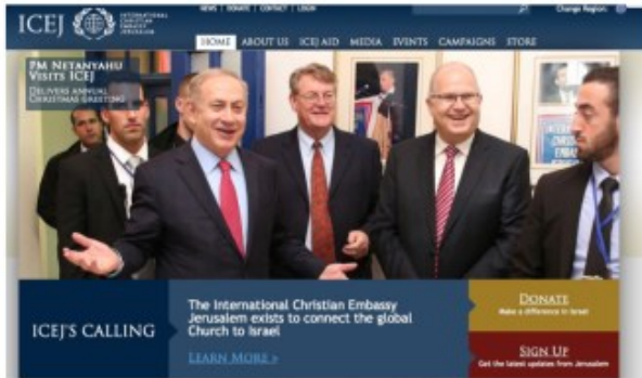
21.12.2016 - 2 years into the desolation