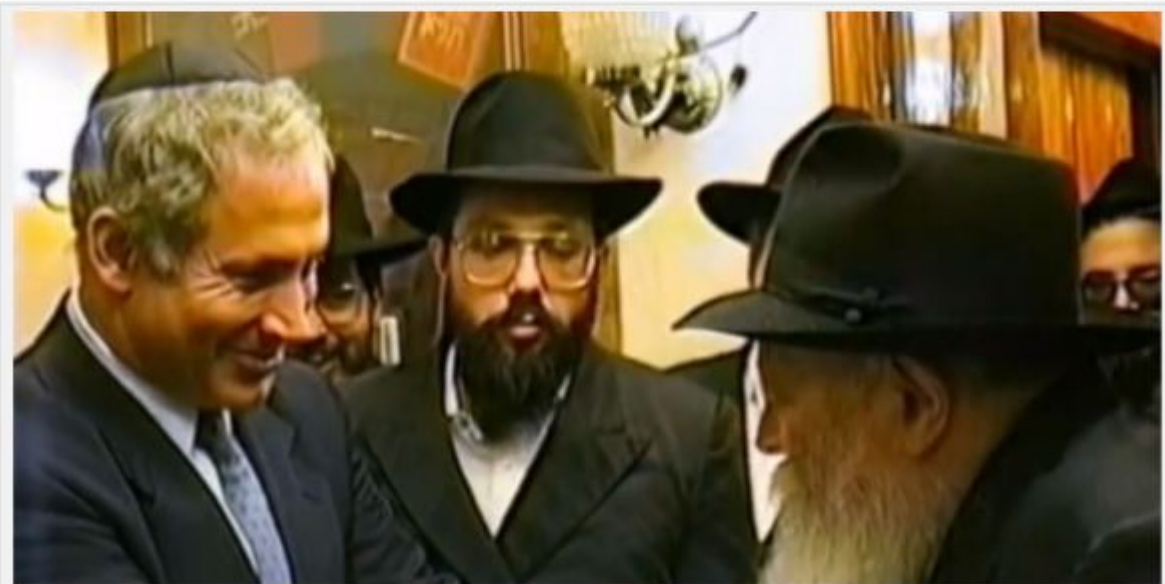
Israel’s Prime Minister Benjamin Netanyahu, when he was Israel’s ambassador to the UN meets the Lubavitcher Rebbe.

“ Like channeled water is the mind of the king in Hashem’s hand; He directs it to whatever He wishes. Proverbs 21:1 (The Israel Bible™)